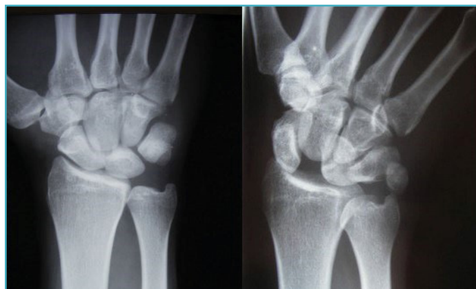
Figure 2 - X-ray showing a gap between the scaphoid and the lunate (left) and a normal x-ray (right)

A diagnosis of scapholunate instability may be difficult to make. Your doctor will examine your wrist to see where it hurts and to check how it moves. X-rays are often used to help understand your wrist pain. Your surgeon may compare the injured wrist with the uninjured wrist. When the ligament is torn, it no longer holds two carpal bones (the scaphoid and the lunate) together, allowing a gap to form between them (Figure 2), and the bones move separately from one another. MRI can also aid in diagnosis of these injuries. If left untreated, ligament tears typically lead to arthritis over time.